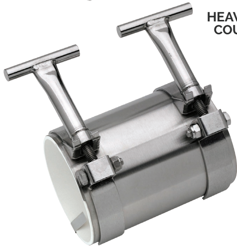
HEAVY DUTY COUPLING